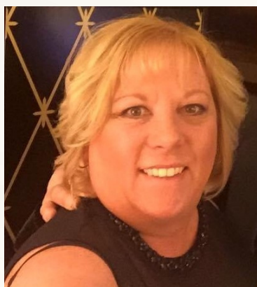
PRO BONO PARALEGAL