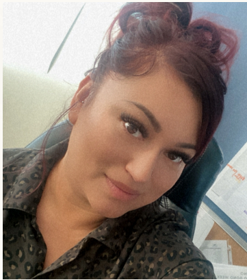
PRO BONO PARALEGAL