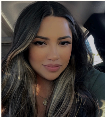
PRO BONO COORDINATOR