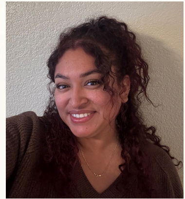
PRO BONO PARALEGAL