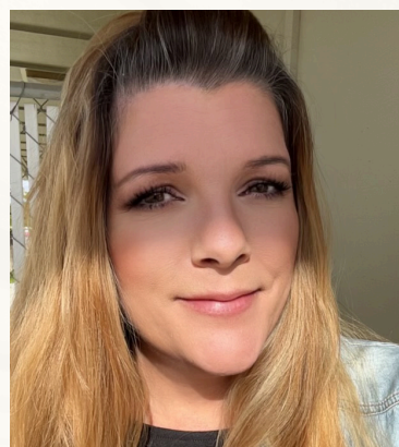
PRO BONO PARALEGAL