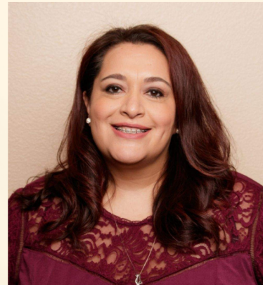
PRO BONO ASSISTANT