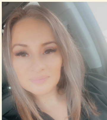
LAWYER IN THE SCHOOL PROGRAM PARALEGAL