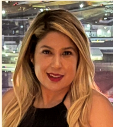
PRO BONO COORDINATOR