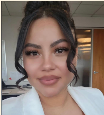
PRO BONO ASSISTANT